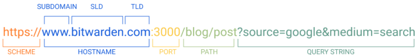
Diagram of a URI

Each URI assigned to a login has an associated match detection option. This option determines when Bitwarden will offer the login as available for autofill, typically determined by matching against specific component pieces. The following graphic breaks down component pieces of a URI: