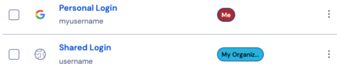
Shared Item icon

Moving an item to an organization will transfer ownership to the organization . This means that anyone with permission can alter the item or delete it, which would remove it from your vault as well. You can tell that an item is shared by the card next to its name: