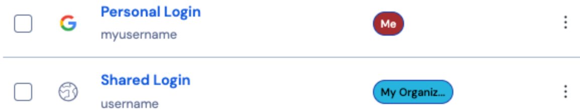
Shared Item icon

Creating a shared item or sharing an item will set ownership to the organization . This means that anyone with permission can alter the item or delete it, which would remove it from your vault as well. You can tell that an item is shared by the card next to its name: