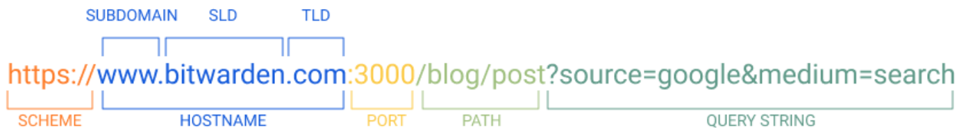
Diagram of a URI

Each URI assigned to a login has an associated match detection option. This option determines when Bitwarden will offer the login as available for autofill, typically determined by matching against specific component pieces. The following graphic breaks down component pieces of a URI: